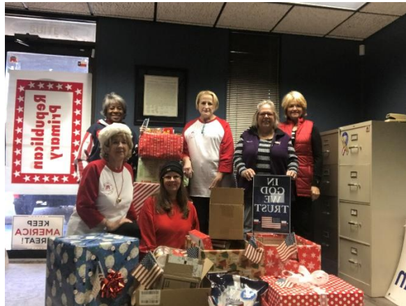
RWGC donated $170 plus to Wreaths Across America