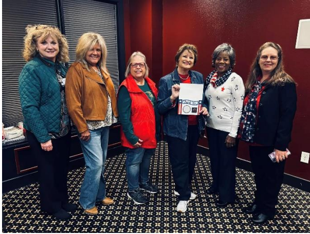
RWGC gave 39 Veteran token Coins to Arabella Veterans and presented the Veteran Appreciation Program. RWGC donated a Freedom is Not Free American Flag to add to their Veteran tree.