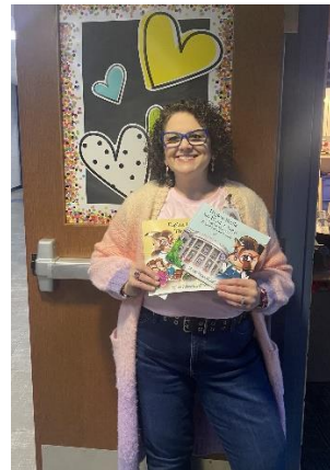
Springhill Primary Librarian presented with books from RWGC