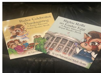
The books presented