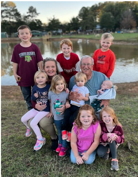
My husband & I with our 9 grandkids!

I have always been Conservative and joined RWGC in September 2022. I am also involved at Mobberly Baptist Church, BSF and T.O.W.N.(Texas Outdoor Women's Network)