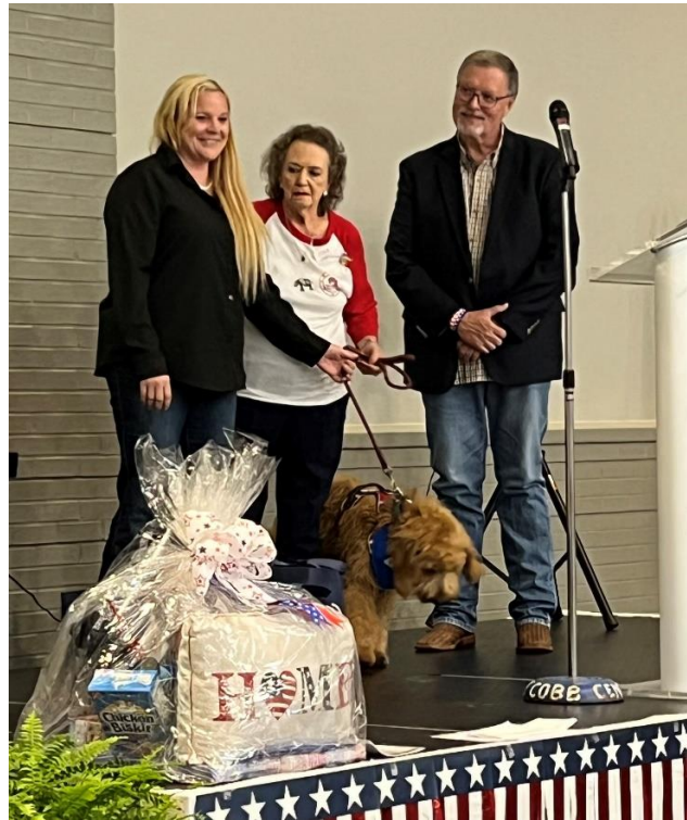
Sarge being presented to a female veteran.